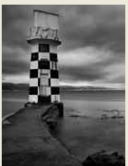
LIGHTHOUSE AT POINT HALSWELL

Northwards around the coast, stop at the rock at Rukutoa. Rukutoa looks out to sea beyond the Pt Halswell Lighthouse, historically an important fishing ground and shellfish-gathering area for inner harbour tribes.