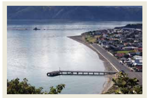
LOOKING DOWN AT SEATOUN BEACH FROM SEATOUN HEIGHTS ROAD.